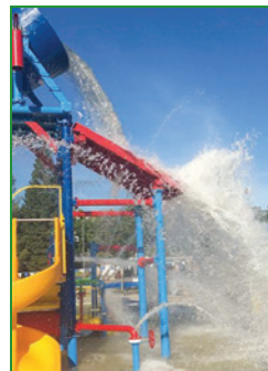
New Play Structure in Motion

please check out the City's website at: www.sanramon.ca.gov/aquatics . PCS will be posting programs and classes as the COVID-19 Shelter-in-Place restrictions allow.