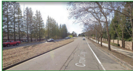
Existing Conditions – West of St. George Rd.

This road widening work is a requirement of the Dougherty Valley Settlement Agreement and is being funded with Developer funds allocated specifically for this project.