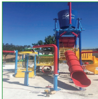
New Play Structure