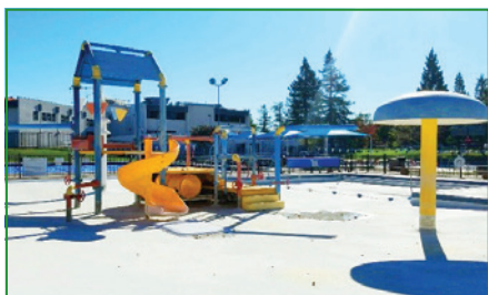
Old Play Structure

The San Ramon Olympic Pool and Aquatic Park is one of the City's most popular facilities with an annual attendance of over 200,000 visits. This facility hosts a number of programs including: swim lessons, dive lessons, exercise programs, open swim, swim meets, and water polo tournaments. The facility is also used for California High School's Physical Education Program. The City's Parks and Community Services Department (PCS) oversees and schedules these programs. If you are interested in finding out more information,